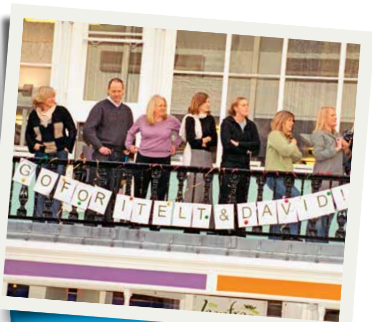
LEFT Elton and Furnish's certificate of civil partnership. ABOVE Onlookers cheer on Elton and Furnish as they emerge from their civil partnership ceremony in Windsor in 2005. BELOW LEFT With their sons, Zachary and Elijah.